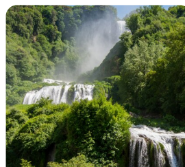
Waterfalls of Marmore Europe's highest man-made waterfalls