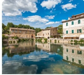
Bagno Vignoni Unique Hot Springs