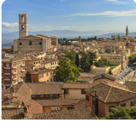
Perugia Explore the Heart of this Ancient City