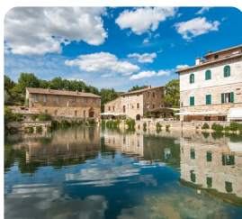
Bagno Vignoni Unique Hot Springs