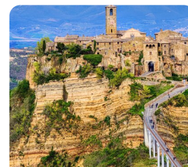
Civita di Bagnoregio A Mysterious Hilltop Town