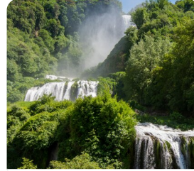
Waterfalls of Marmore Europe's highest man-made waterfalls