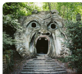
Sacro Bosco Park of the Monsters