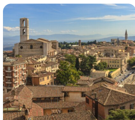
Perugia Explore the Heart of this Ancient City