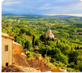
Val d'Orcia Explore Montepulciano & Pienza