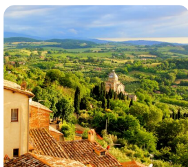
Val d'Orcia Explore Montepulciano & Pienza