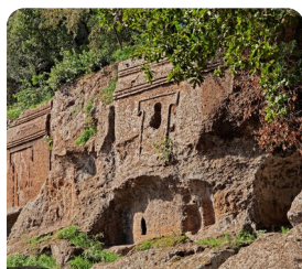
Tarquinia Guided tour of an Etruscan Necropolis

These are just a few of the very special hand selected inclusions that will really make your touring experience exceptional and unique, and don't forget, with Albatross they are always included.