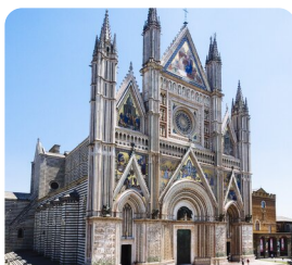
Orvieto Guided Walking Tour