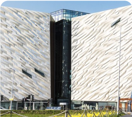
Belfast The Titanic Experience

Correct as of 06:38 on 22nd December 2025