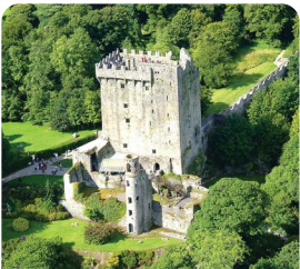
Cork Blarney Castle, Woollen Mills & Cobh Heritage Centre