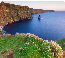
Cliffs of Moher Spectacular Views