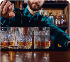
Bushmills Distillery Whiskey Tour & Tasting