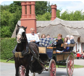
Killarney Lough Léin Cruise & Jaunting Cars