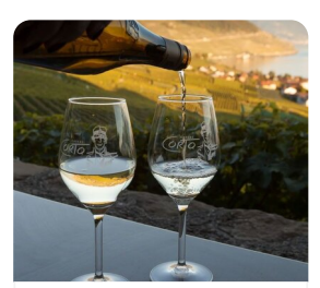
Lavaux Wine Road Vinorama