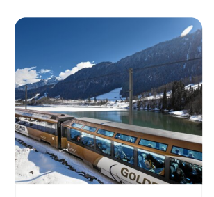
Golden Pass Railway Panoramic Train Journey