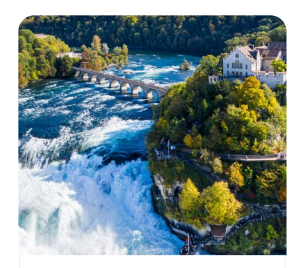
Rhine Falls Rhine Falls at Schaffhausen