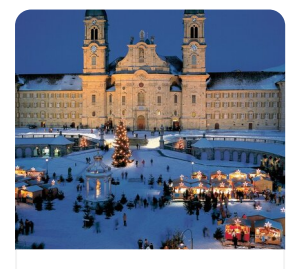
Einsiedeln Abbey And Christmas Markets

These are just a few of the very special hand selected experiences that will really make your touring experience exceptional and unique, and don't forget, with Albatross they are always included.