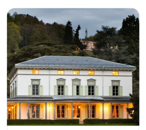
Charlie Chaplin's House Chaplin World