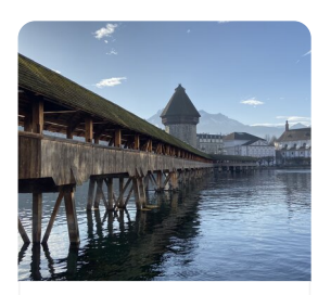
Luzern Walking Tour