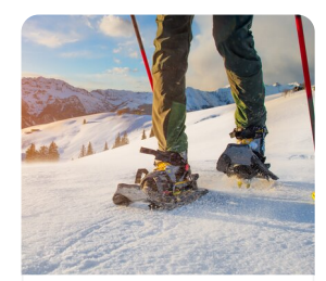
Snow Shoe Walk Through the Local Countryside