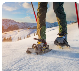
Snow Shoe Walk Through the Local Countryside