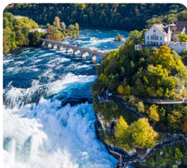
Rhine Falls Rhine Falls at Schaffhausen