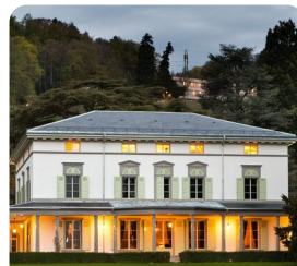
Charlie Chaplin's House Chaplin World