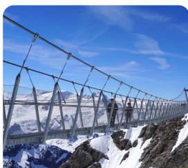
Mt Titlis Cable car ride