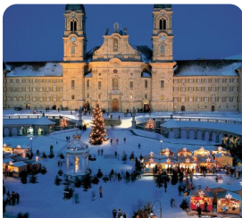
Einsiedeln Abbey And Christmas Markets

These are just a few of the very special hand selected experiences that will really make your touring experience exceptional and unique, and don't forget, with Albatross they are always included.