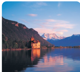
Chateau Chillon Guided Tour