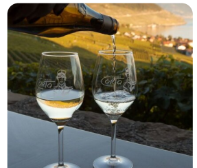
Lavaux Wine Road Vinorama