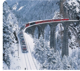
Glacier Express Panoramic Train