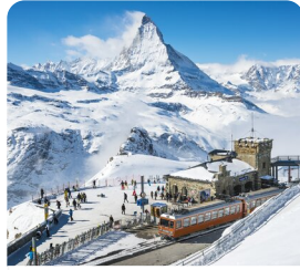
Zermatt Ride the Gornergrat Cog Railway