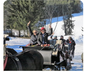
Horse and Carriage Ride Through the Local Countryside