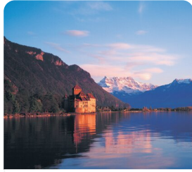
Chateau Chillon Guided Tour