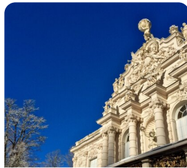
Linderhof Palace Guided Tour