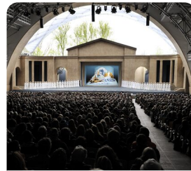
Oberammergau Passion Play Theatre Guided Tour