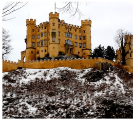
Hohenschwangau Castle Guided Tour