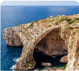
Hagar Qim & The Blue Grotto Ancient Temples & a Boat Cruise