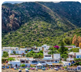
Panarea and Stromboli Afternoon Cruise & Evening 'Stromboli Fireworks'