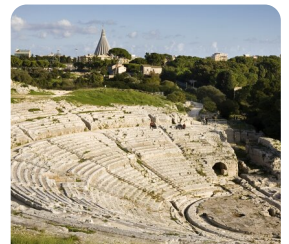
Syracuse & Ortigia Ancient Ruins & a Historical Centre