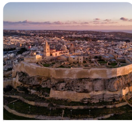
Island of Gozo Victoria Citadel and Xlendi