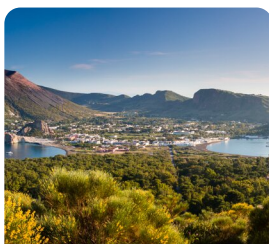
Vulcano Panoramic Drive