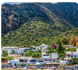
Panarea and Stromboli Afternoon Cruise & Evening 'Stromboli Fireworks'