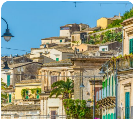
Modica Cioccolato di Modica