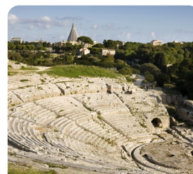
Syracuse & Ortigia Ancient Ruins & a Historical Centre