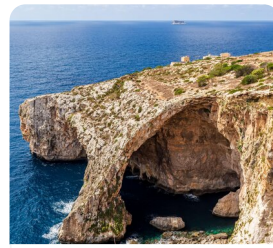
Haġar Qim & The Blue Grotto Ancient Temples & a Boat Cruise