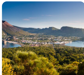
Vulcano Panoramic Drive