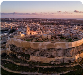
Island of Gozo Victoria Citadel and Xlendi