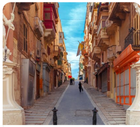
Valletta Guided walking tour and visit The Malta Experience