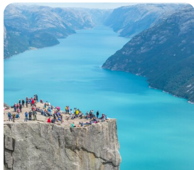
Stavanger Lysefjord Cruise for Pulpit Rock

These are just a few of the very special hand selected inclusions that will really make your touring experience exceptional and unique, and don't forget, with Albatross they are always included.