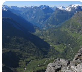
Dalsnibba Pass Visit the incredible Geiranger Skywalk