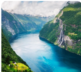
Geiranger Fjord Cruise down the UNESCO Geiranger Fjord