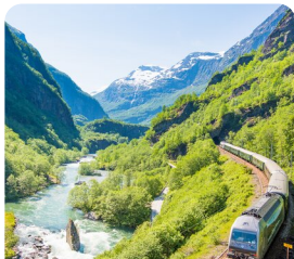
Flam Railway World Famous, Scenic Train Ride