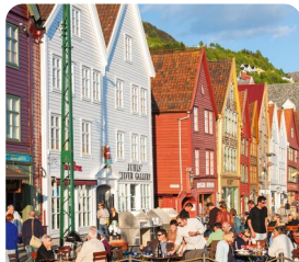
Bergen Bryggen & Fløibanen Funicular