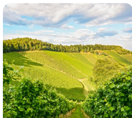
Rioja Wine region Scenic Drive & Wine Tasting

These are just a few of the very special hand selected inclusions that will really make your touring experience exceptional and unique, and don't forget, with Albatross they are always included.