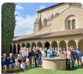
Abbey of St Hilaire 14th Century Cloisters