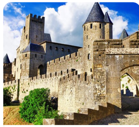
Carcassonne Guided Walking Tour