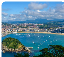
San Sebastian Guided Walking Tour