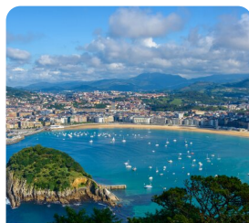
San Sebastian Guided Walking Tour