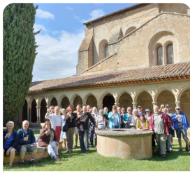
Abbey of St Hilaire 14th Century Cloisters