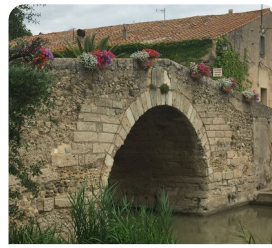
Le Somail Lunch beside the Canal du Midi