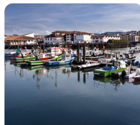
Saint Jean-de-Luz Delightful Seaside Town