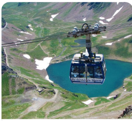
Pic du Midi Stunning Cable Car Ride