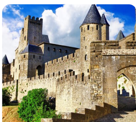
Carcassonne Guided Walking Tour