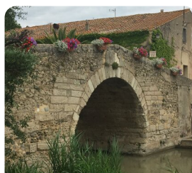
Le Somail Lunch beside the Canal du Midi