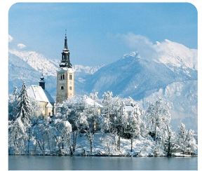
Lake Bled Bled Castle & Pletna Boat Cruise