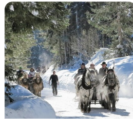
Filzmoos Horse Drawn Carriage Ride