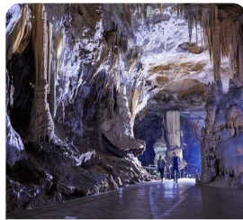
Postojna Caves Mesmerising Cave Adventure