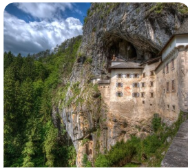
Predjama Castle A Cliff Clinging Castle