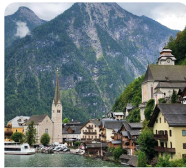
St Wolfgangsee In the Salzkammergut