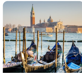
Venice Walking Tour