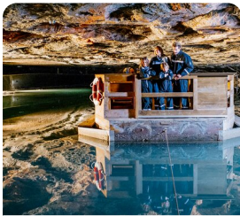
Salt Mines Berchtesgaden

These are just a few of the very special hand selected experiences that will really make your touring experience exceptional and unique, and don't forget, with Albatross they are always included.