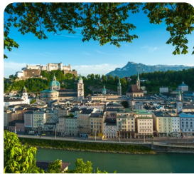
Salzburg Guided Walking Tour