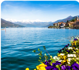
Bellagio on Lake Como Private Boat Cruise

These are just a few of the very special hand selected experiences that will really make your touring experience exceptional and unique, and don't forget, with Albatross they are always included.