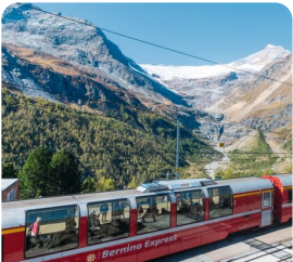
Bernina Express Train to St Moritz