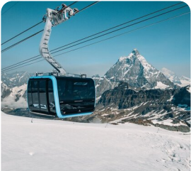
The Mighty Matterhorn Experience Trans-alpine cable car journey