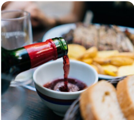
Lugano Food & Wine Tour