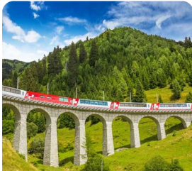
Ride the Glacier Express Panoramic Train