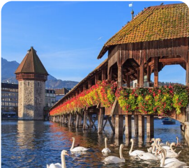
Luzern Lake Cruise and Funicular Train to Bürgenstock