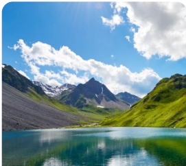
Arosa Alpine Village Mountain lunch and Bear sanctuary