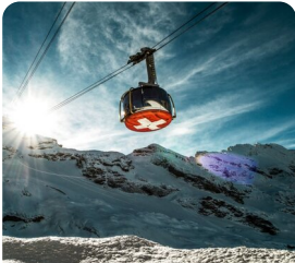
Titlis Rotair Cable Car Rotating Cable Car and Mount Titlis Lunch