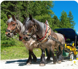
St Moritz Horse & Carriage Ride