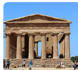
Agrigento Valley of the Temples