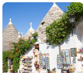
Alberobello Trulli "Bee-Hive" Houses

These are just a few of the very special hand selected experiences that will really make your touring experience exceptional and unique, and don't forget, with Albatross they are always included.