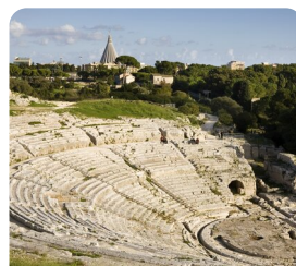
Syracuse & Ortigia Ancient Ruins & a Historical Centre