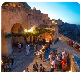
Matera Stay in an extraordinary Cave Hotel