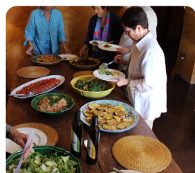
Mandranova Estate Olive Oil Tasting & Light Lunch