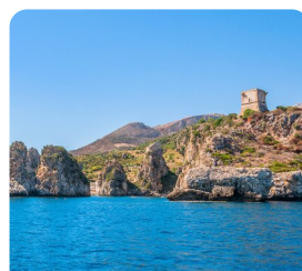
Zingaro Nature Reserve Coastal Boat Cruise