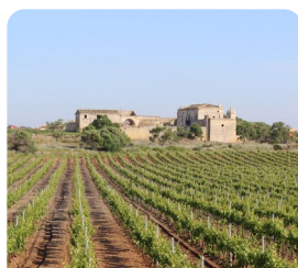
Baglio Oneto Wine Tasting