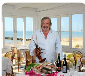
Vittorio's restaurant Delicious Seafood Lunch