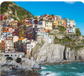
Cinque Terre Discover colourful Fishing Villages