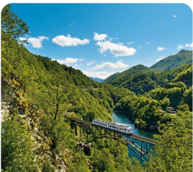
Centovalli Express train Travel through the 'Hundred Valleys' to Locarno