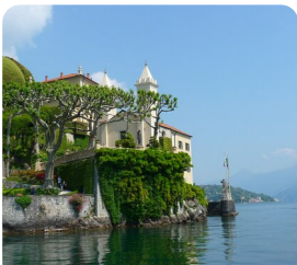
Lake Como Private Boat Cruise