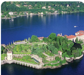
Isola Bella Private Boat Cruise & Guided Tour

These are just a few of the very special hand selected experiences that will really make your touring experience exceptional and unique, and don't forget, with Albatross they are always included.