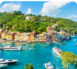
Portofino Abbey of San Fruttuoso