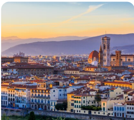
Florence Walking tour & visit Accademia Gallery