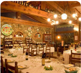
Redaelli de Zinis Wine Tasting & Lunch