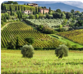
Olive Oil Tasting & Dinner In the Tuscan Countryside