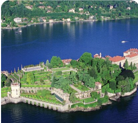
Isola Bella Private Boat Cruise & Guided Tour

These are just a few of the very special hand selected experiences that will really make your touring experience exceptional and unique, and don't forget, with Albatross they are always included.