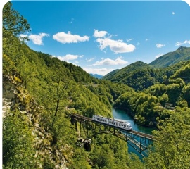
Centovalli Express train Travel through the 'Hundred Valleys' to Locarno