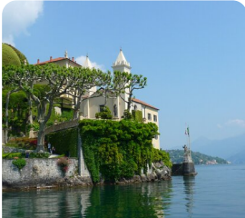
Lake Como Private Boat Cruise