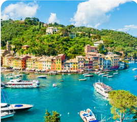
Portofino Abbey of San Fruttuoso