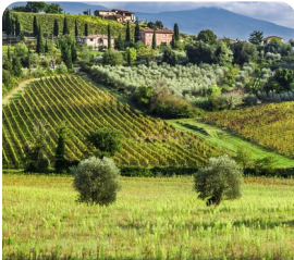
Olive Oil Tasting & Dinner In the Tuscan Countryside