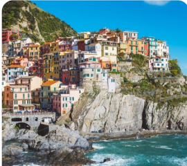
Cinque Terre Discover colourful Fishing Villages