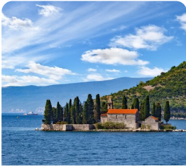
Montenegro Kotor & Perast Boat Cruise to Our Lady of the Rock