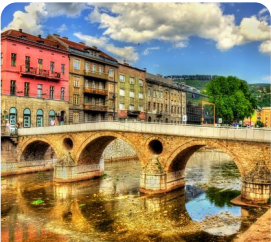
Sarajevo Guided tour & visit Memorial Museum of Srebrenica