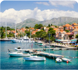
Cavtat Cruise and Farewell Dinner

Correct as of 01:52 on 12th December 2025