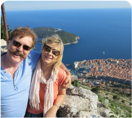
Dubrovnik Mt Srd Cable Car, Walking Tour & 'Peka' lunch