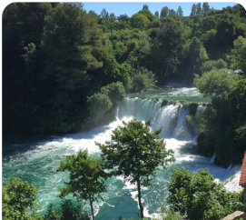
Krka National Park Skradiniski Buk Falls & Boat Cruise to Skradin