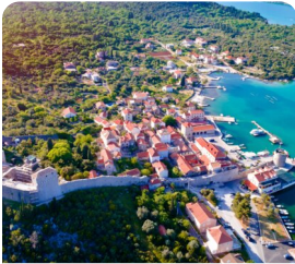
Mali Ston Oyster Tasting and a Lazy Lunch