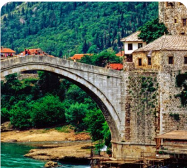
Mostar Guided Walking Tour