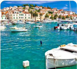
Hvar Sightseeing, Wine Tasting and a Leisurely Lunch