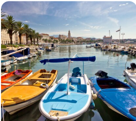
Split Klis Castle & Guided Walking Tour

These are just a few of the very special hand selected experiences that will really make your touring experience exceptional and unique, and don't forget, with Albatross they are always included.