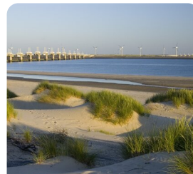
Delta Project 3 Massive Dykes