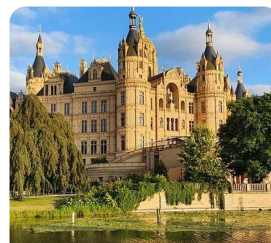
Schwerin Castle The 'Neuschwanstein of the North'