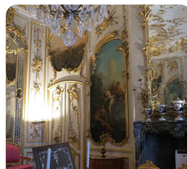
Potsdam Palaces UNESCO Heritage listed palaces