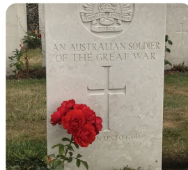
Ypres Flanders Fields & the Menin Gate