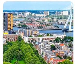
Rotterdam Port Cruise