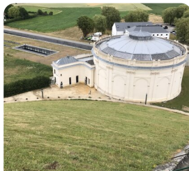
Waterloo Visit the Site of the Battle of Waterloo