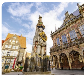
Bremen UNESCO listed Town Hall