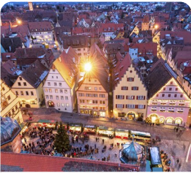
Rothenburg Christmas Markets Picture-postcard Rothenburg Ob Der Tauber

Correct as of 13:48 on 13th September 2025