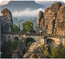
Saxon Switzerland Visit the Pristine National Park