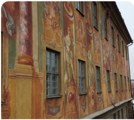
Bamberg UNESCO World Heritage Site