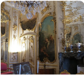
Potsdam Sanssouci Palace