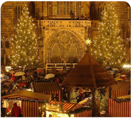
Nürnberg Christmas Markets