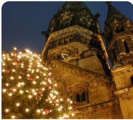
Berlin Guided Panoramic City Tour

These are just a few of the very special hand selected experiences that will really make your touring experience exceptional and unique, and don't forget, with Albatross they are always included.