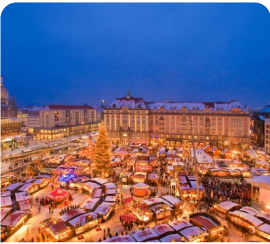
Dresden Visit the Royal Palace & Christmas Markets