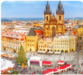
Prague Sightseeing Tour & Christmas Markets