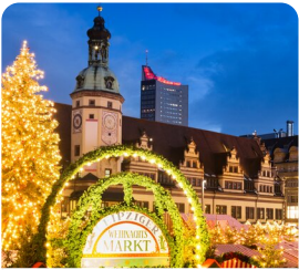
Leipzig One of Europe's oldest and largest Christmas Markets