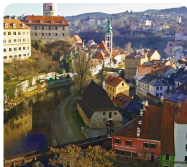
Český Krumlov Guided Tour