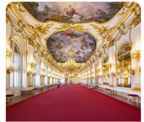
Schönbrunn Palace Guided Tour