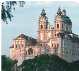
Melk Abbey Guided Tour