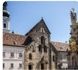
Heiligenkreuz Monastery Guided Tour