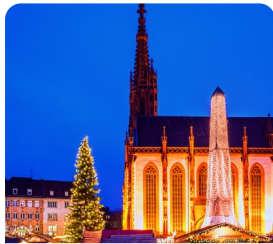
Würzburg Christmas Markets

These are just a few of the very special hand selected experiences that will really make your touring experience exceptional and unique, and don't forget, with Albatross they are always included.