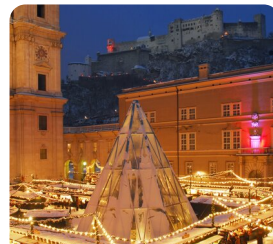
Salzburg Walking Tour & Christmas Markets