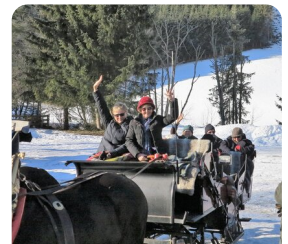
Horse and Carriage Ride Through the Local Countryside