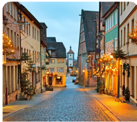
Rothenburg Night Watchman Walking Tour