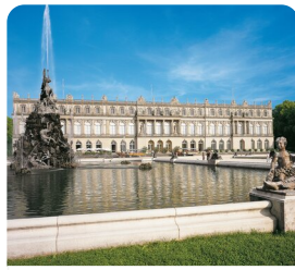
Herrenchiemsee Palace Guided Visit