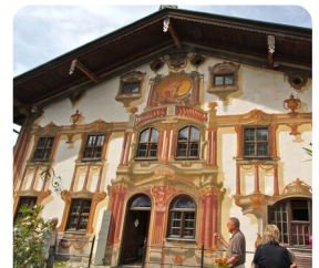
Oberammergau Traditional Bavarian Village