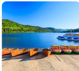
Lake Titisee Lunch and Lake Cruise