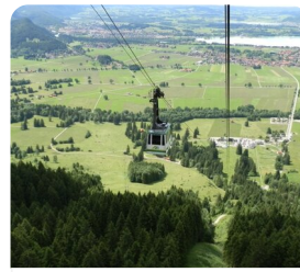
Tegelberg Cable Car Ride