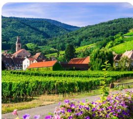
Alsace Wine Road Wine Tasting

These are just a few of the very special hand selected inclusions that will really make your touring experience exceptional and unique, and don't forget, with Albatross they are always included.