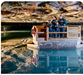
Salt Mines Berchtesgaden