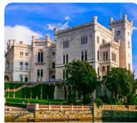
Castello di Miramare Nature & History