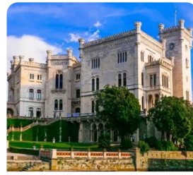
Castello di Miramare Nature & History