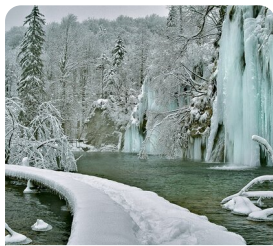
Plitvice Majestic Waterfalls