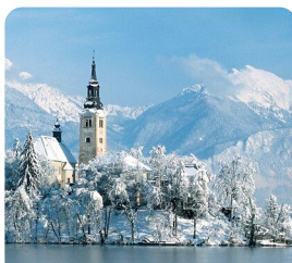
Lake Bled Bled Castle, Pletna Boat Cruise & Horse and Carriage ride