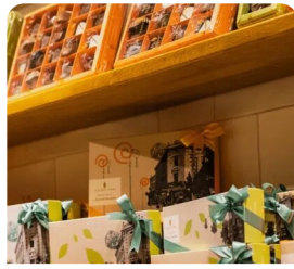
Chocolate Tasting Opatija