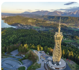
Pyramidenkogel Observation Tower