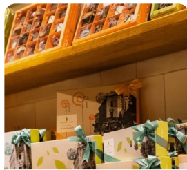
Chocolate Tasting Opatija