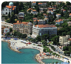
Opatija Spend Christmas by the sea