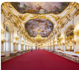
Schönbrunn Palace Guided Tour

These are just a few of the very special hand selected experiences that will really make your touring experience exceptional and unique, and don't forget, with Albatross they are always included.