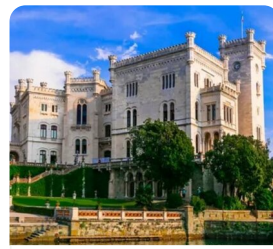
Castello di Miramare Nature & History