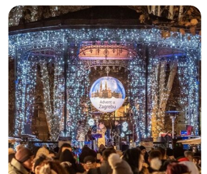
Zagreb Christmas Markets