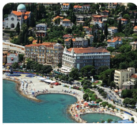
Opatija Spend Christmas by the sea