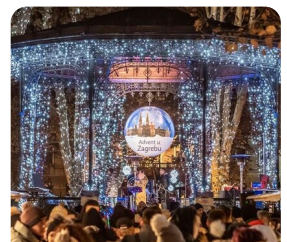
Zagreb Christmas Markets