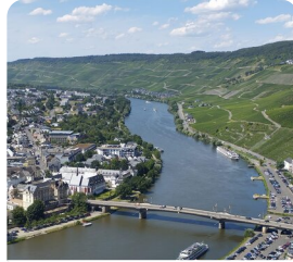
Rhine River Cruise Rüdesheim to Boppard