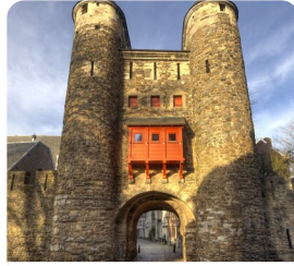
Maastricht Guided Tour of the North Caves