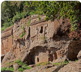
Tarquinia Guided tour of an Etruscan Necropolis

These are just a few of the very special hand selected experiences that will really make your touring experience exceptional and unique, and don't forget, with Albatross they are always included.