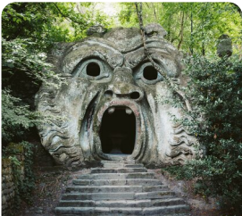
Sacro Bosco Park of the Monsters