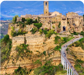
Civita di Bagnoregio A Mysterious Hilltop Town