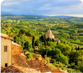
Val d'Orcia Explore Montepulciano & Pienza