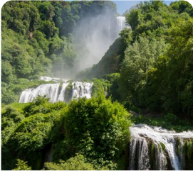
Waterfalls of Marmore Europe's highest man-made waterfalls