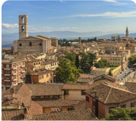
Perugia Explore the Heart of this Ancient City