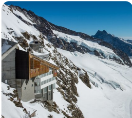
Jungfrau Railway Journey to the Roof of the World

These are just a few of the very special hand selected experiences that will really make your touring experience exceptional and unique, and don't forget, with Albatross they are always included.