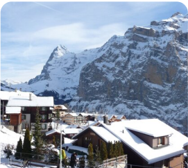
Mürren Alpine Village