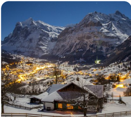
Grindelwald By Cable Car