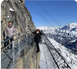
Birg Thrill Walk Ride the new Funifor Cableway to Birg