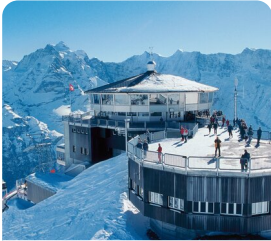
Schilthorn Summit Cable Car & Schilthorn Brunch