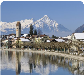
Interlaken 'Between the Lakes'