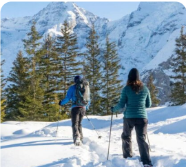
Wengen Snowshoe Walk & Ice Curling