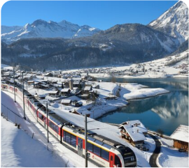
Zentralbahn Panoramic train Unforgettable Train Journey