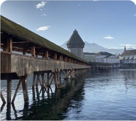
Luzern Walking Tour