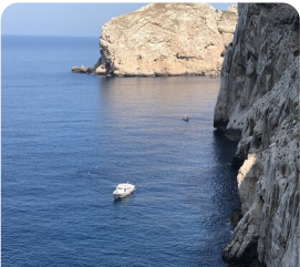
Alghero Visit Neptune's Caves