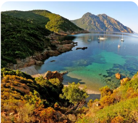
Scandola Nature Reserve Coastal Boat Cruise & Lunch in Girolata