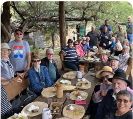
Supramonte Mountains 4WD Excursion & Shepherd's Picnic Lunch