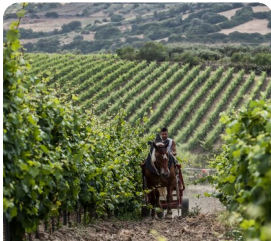
Olianas Winery Vineyard Tour, Tasting & Light Lunch

These are just a few of the very special hand selected experiences that will really make your touring experience exceptional and unique, and don't forget, with Albatross they are always included.