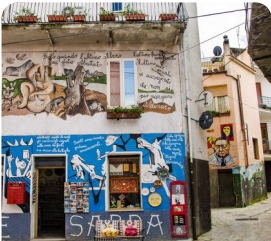
Orgosolo The Village of Murals