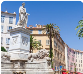
Ajaccio Napoleon's Birthplace