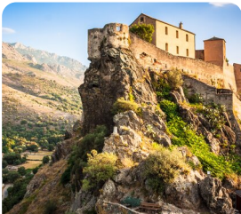
Corte Scenic Train Ride