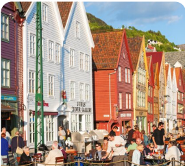
Bergen Bryggen & Fløibanen Funicular