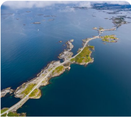
Atlantic Ocean Road 'The Most Beautiful Coastal Drive in the World'