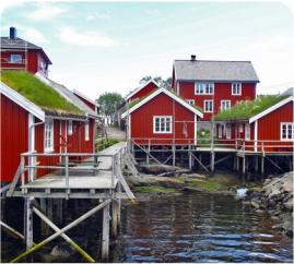
Lofoten Archipelago Stay in Historic Fisherman's Cabins