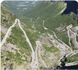
Trollstigen World famous 'Trolls Road'