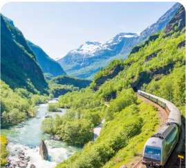
Flam Railway World Famous, Scenic Train Ride