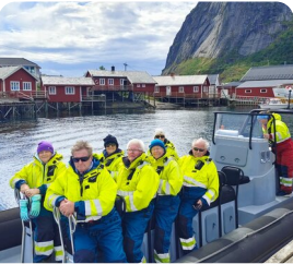
Lofoten Islands RIB Boat Excursion