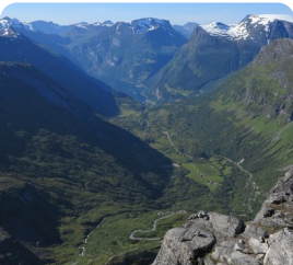
Dalsnibba Pass Visit the incredible Geiranger Skywalk