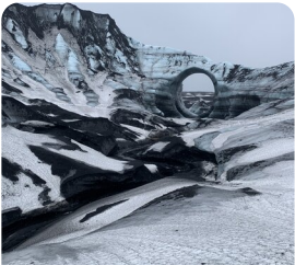
Katla Ice Cave Excursion to the Katla Ice Cave