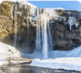
Seljalandsfoss waterfall Visit the stunning waterfall