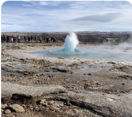
Geyser Hot Spring Geyser Hot Spring thermal area