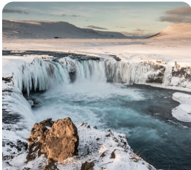
Goðafoss Goðafoss Falls

These are just a few of the very special hand selected experiences that will really make your touring experience exceptional and unique, and don't forget, with Albatross they are always included.