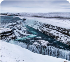
Gullfoss Falls Visit Gullfoss Falls