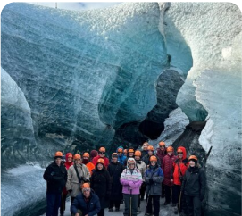
Jökulsárlón Glacier Lagoon Visit the Glacier Lagoon and Blue Crystal Ice Cave