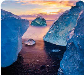
Diamond Beach Walk along the Diamond Beach