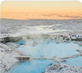
Blue Lagoon Thermal pools