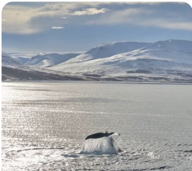
Whale Watching Cruise On an Icelandic Oak boat