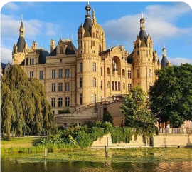
Schwerin Castle The 'Neuschwanstein of the North'