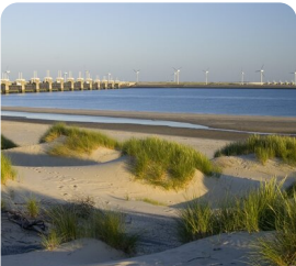
Delta Project 3 Massive Dykes