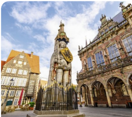
Bremen UNESCO listed Town Hall