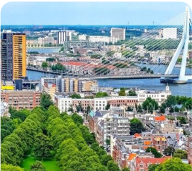
Rotterdam Port Cruise