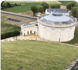
Waterloo Visit the Site of the Battle of Waterloo