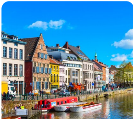
Glorious Ghent Guided Walking Tour and Canal Cruise

These are just a few of the very special hand selected experiences that will really make your touring experience exceptional and unique, and don't forget, with Albatross they are always included.