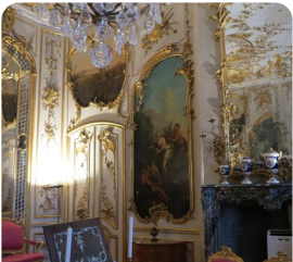
Potsdam Palaces UNESCO Heritage listed palaces