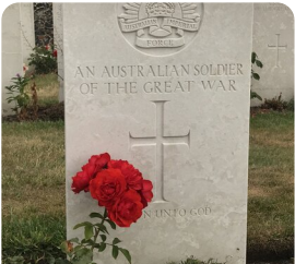
Ypres Flanders Fields & the Menin Gate