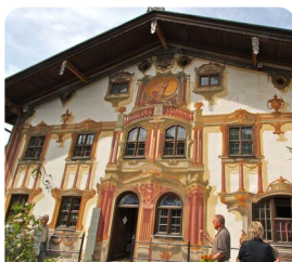
Oberammergau Traditional Bavarian Village