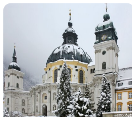
Kloster Ettal Monastery