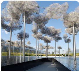
Swarovski Crystal Worlds 'Kristallwelten'