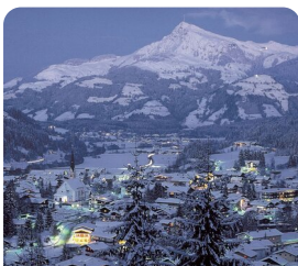
Kirchberg in the Tyrol A Festive 7 night Christmas Stay

These are just a few of the very special hand selected experiences that will really make your touring experience exceptional and unique, and don't forget, with Albatross they are always included.