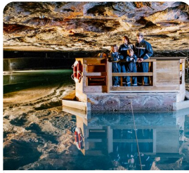
Salt Mines Berchtesgaden