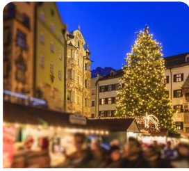
Innsbruck Christmas Markets & the 'Golden Roof'