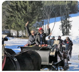
Horse and Carriage Ride Through the Local Countryside